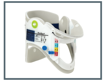
Ambu® Perfit ACE®