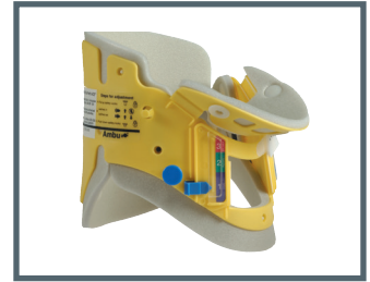
Ambu® Mini Perfit ACE®