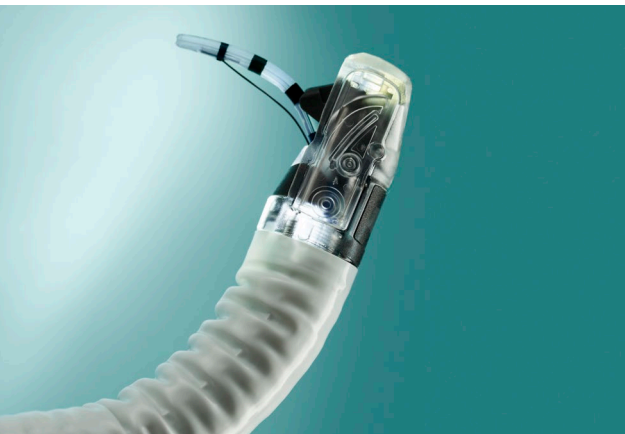
Distal tip showing elevator in use with a sphincterotome

With aScope™ Duodeno, you have a new scope with consistent performance every time, and there is no risk of patient cross-contamination. What's more, there's no need for costly reprocessing or repair.