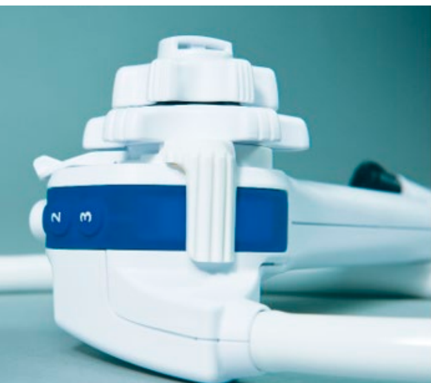
Elevator control lever to raise (up) and lower (down) the elevator

Ambu® aScope™ Duodeno Sterile. Single-use. Problem solved.